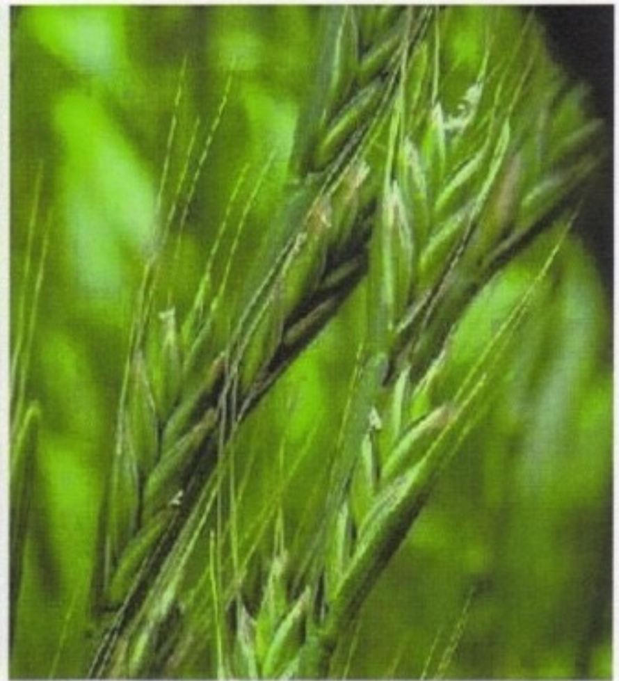
WEEDS : Lolium Temulentum