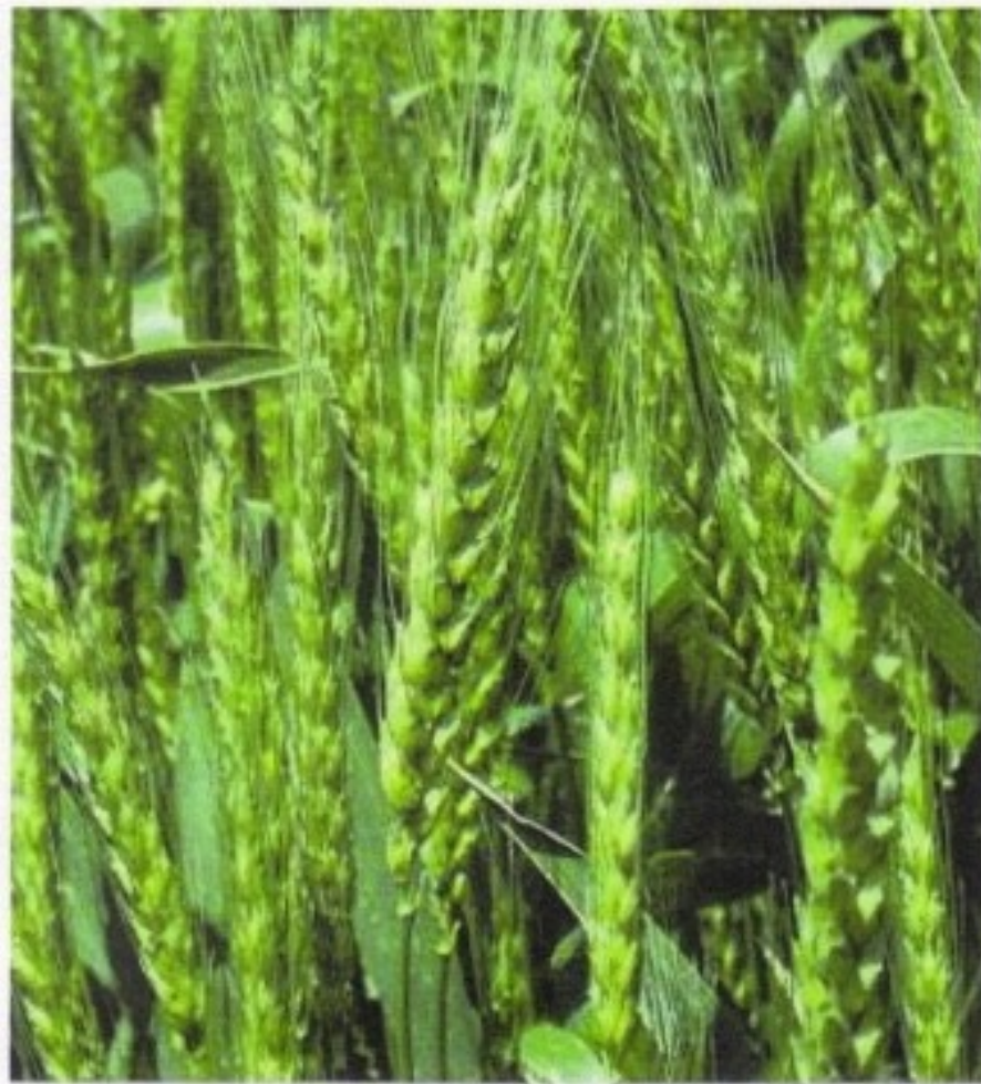
WHEAT: before it is fully ripe.