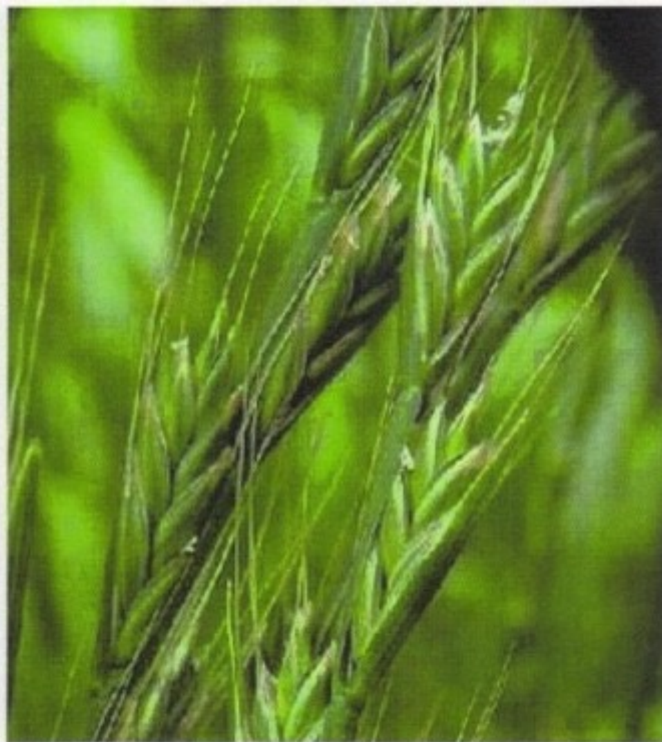
WEEDS : Lolium Temulentum